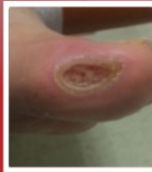
Date: 11/12/2010 2 weeks after 1st Derma- graft application Wound Size: 0.6cm x 1.4cm x 0.2cm