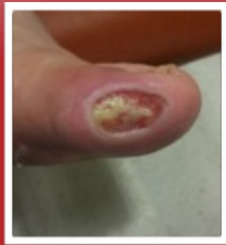
Date: 09/8/2010 local wound care Wound Size: 1.1cm x 1.9cm x 0.3cm