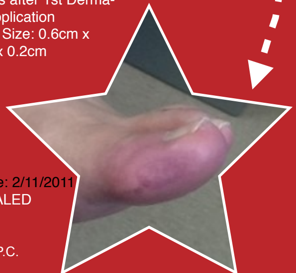
Date: 2/11/2011 HEALED