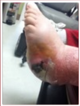
Date: 10/12/2011 Pre-Debridement Infection with abscess

The patient's ulcer healed completely after 2 applications of Theraskin and a percutaneous achilles tendon lengthening.