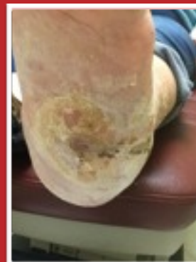
Date: 1/18/2012 Eval & debride Wound Size: 3.0cm x 0.4cm x .1cm